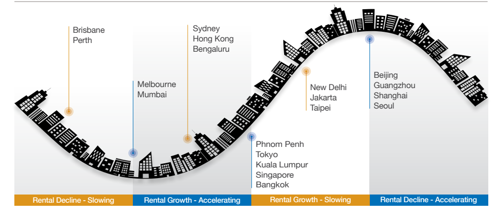
Figure 1 Prime Office Rental Cycle