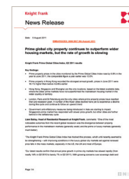
Prime Global Cities Index August 2011

Knight Frank Research Reports are available at www.KnightFrank.com/Research