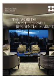
Super-prime London Report 2011