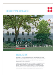
The London Review Autumn 2011