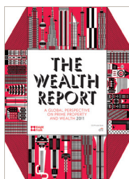
The Wealth Report 2011