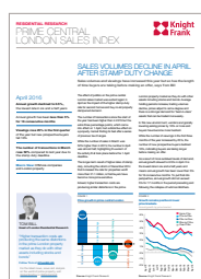
Prime Central London Sales Index - Apr 2016