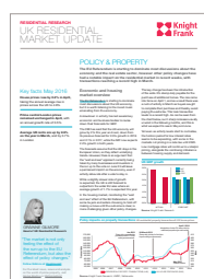
UK Residential Market Update - May 2016