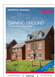
UK Housebuilding Report - 2015

Knight Frank Research Reports are available at KnightFrank.com/Research