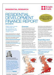
Development Finance Report - 2015