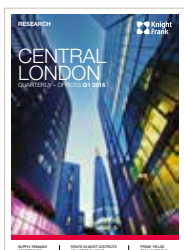
Central London Quarterly - Q1 2016