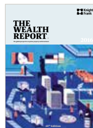
The Wealth Report 2016