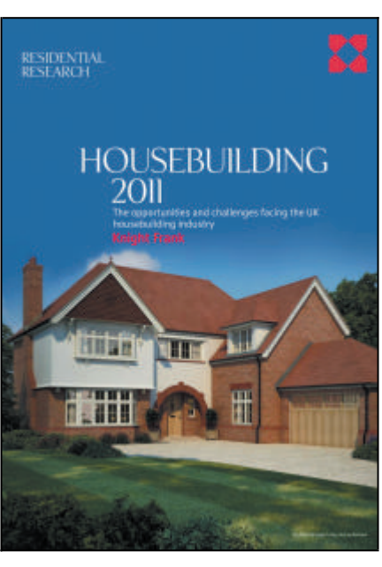
View the Housebuilding 2011 PDF