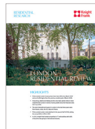
The London Review Spring 2013