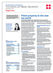
Taxation of Prime Property Dec 2012