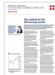
UK Housing Market Forecast

Knight Frank Research Reports are available at www.KnightFrank.com/Research