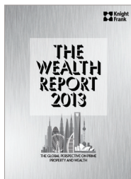
The Wealth Report 2013