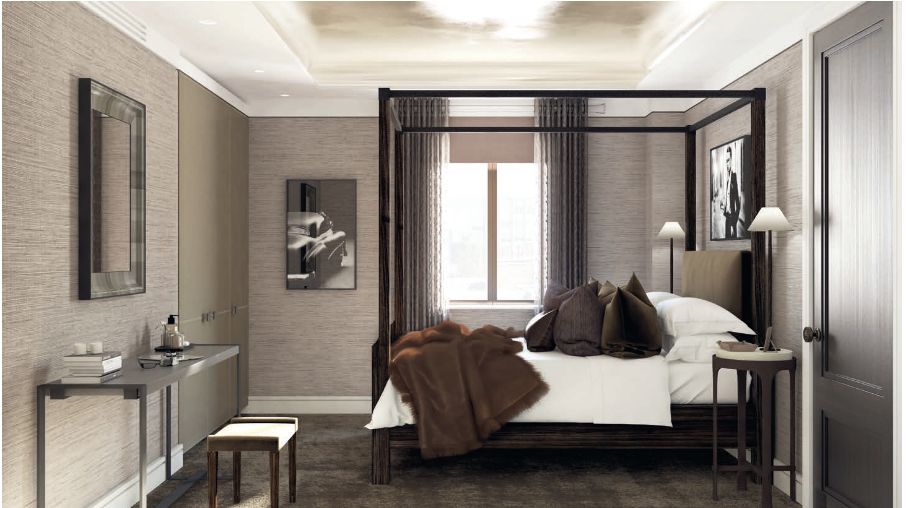
Computer generated image is indicative only