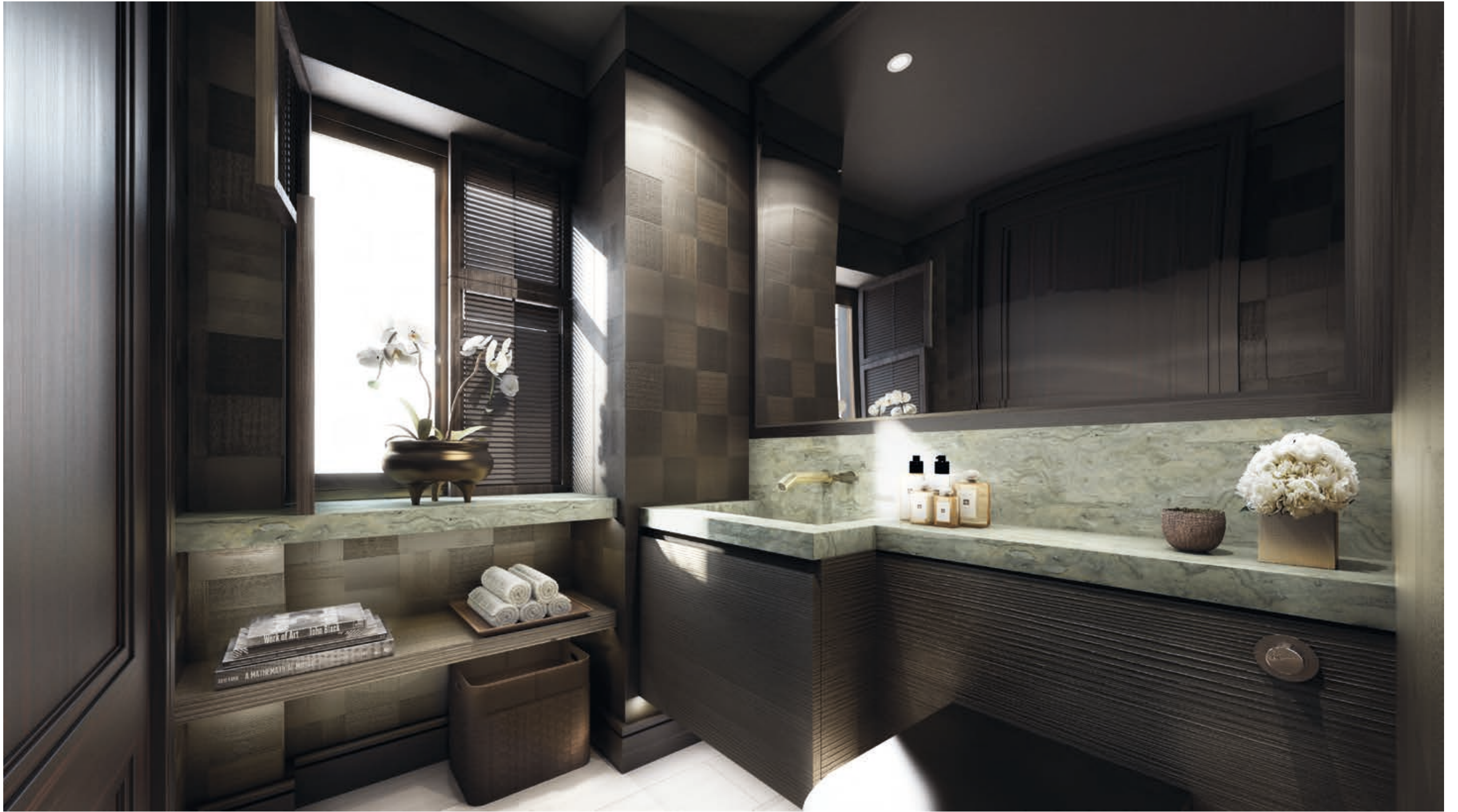
Computer generated image is indicative only