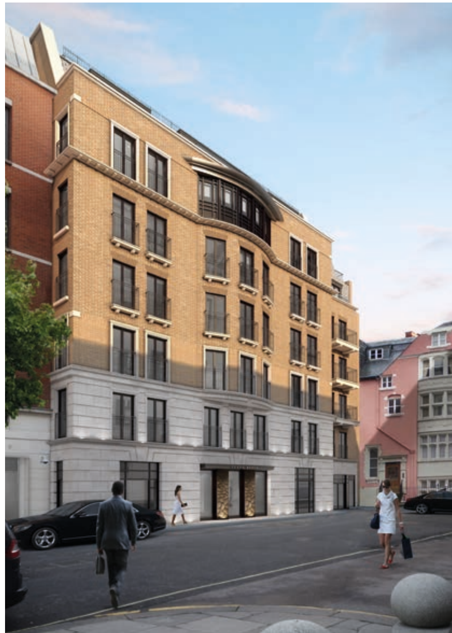
Computer generated image is indicative only